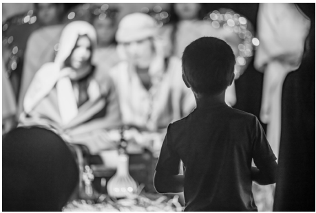
Attendees gather at the manger birth scene.